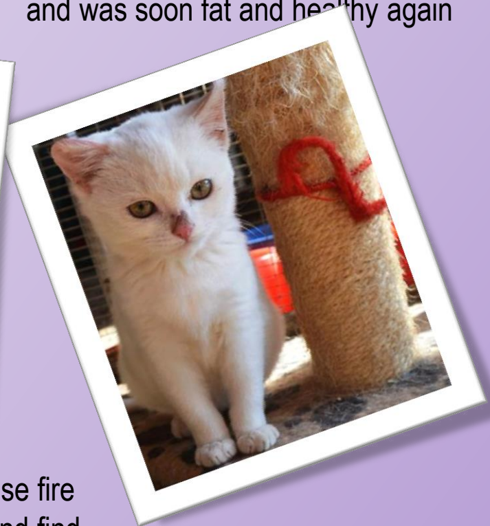
Before & After Wet Nose rescued Tigger from a house fire and she recovered to to be healthy and find a fantastic new home.

What a wonderful thought... that my love for animals can live forever!